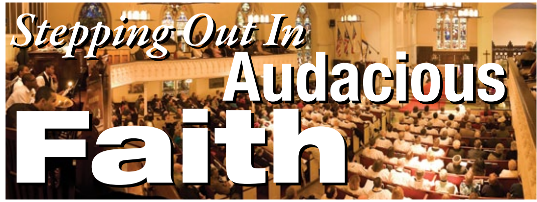
Deputies gather for the Eucharist at Diocesan Convention 2010.

The annual convention of the Diocese of Newark will be a place for transformation and inspiration